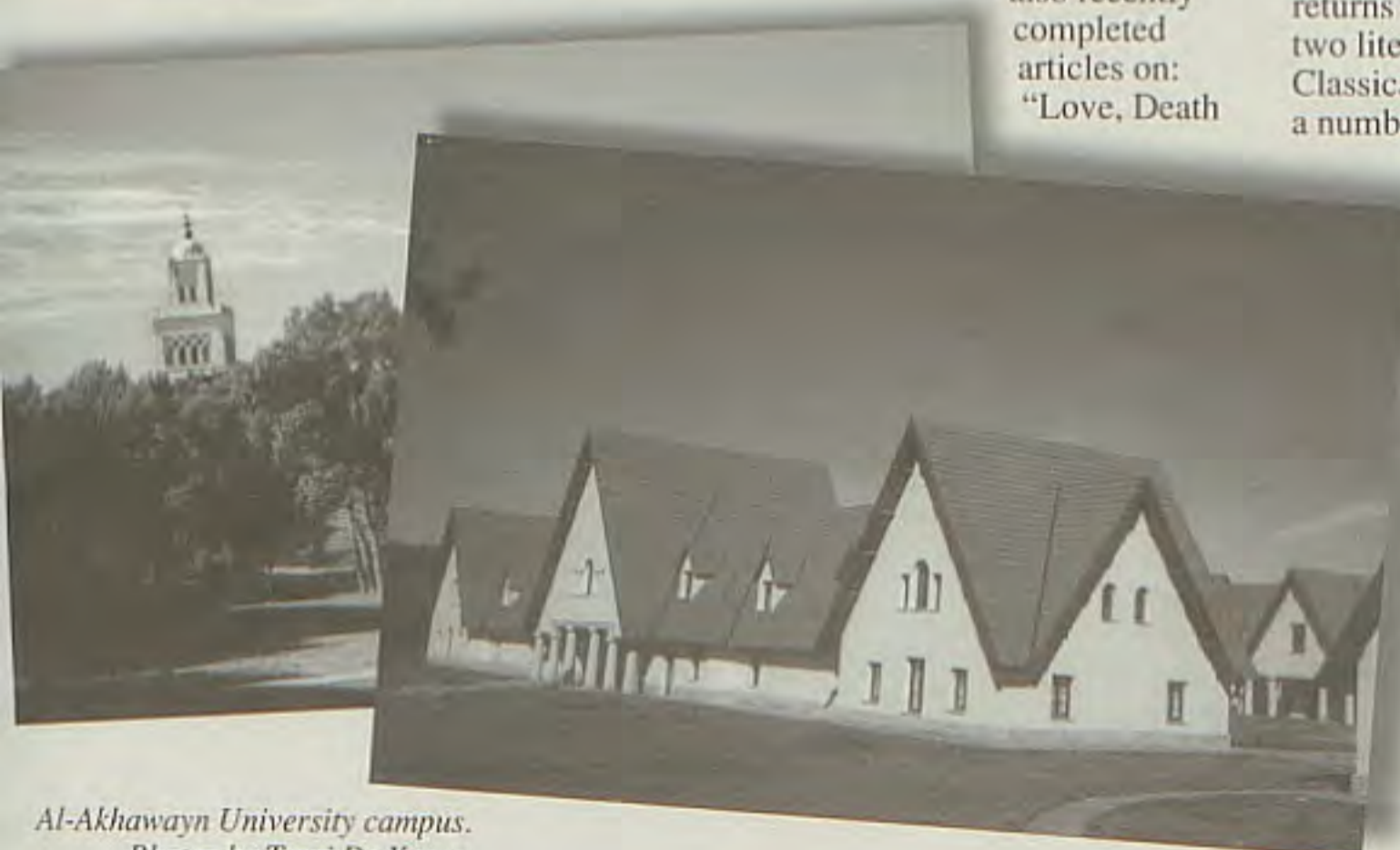
Al-Akhawayn University campus.

program at al-Akhawayn for students who completed the first year of distance learning course. This year she begins a three-year term as Director of the Middle East Center in the Jackson School of International Studies.