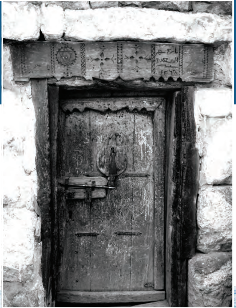
Door from old Jewish quarter in the mountain town of Manakha, Yemen.