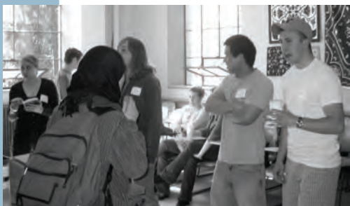
NELC Student Group members greet visitors.