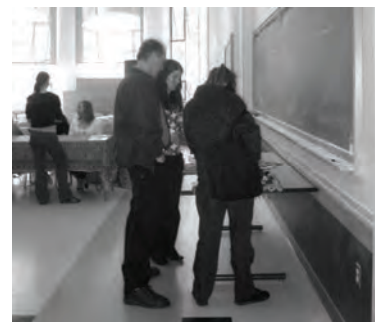
Students demonstrate how to write visitors' names in NELC languages.

from sites and experiences visited while studying abroad and guests were encouraged to vote for their favorite image (see back page for the winner!). With over one hundred visitors, the event was a great success, and the Student Group invites you to join them again next year.